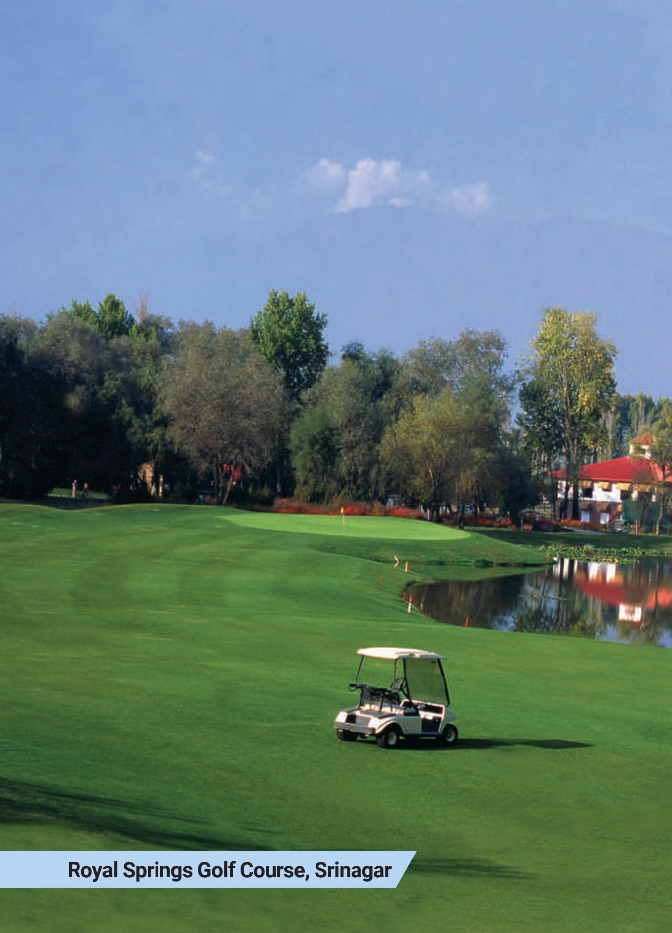
Royal Springs Golf Course, Srinagar