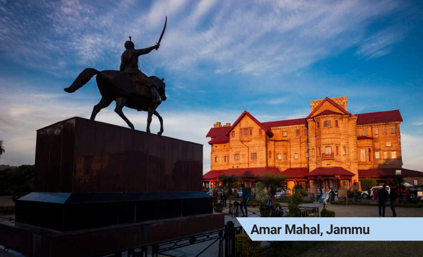
Amar Mahal, Jammu