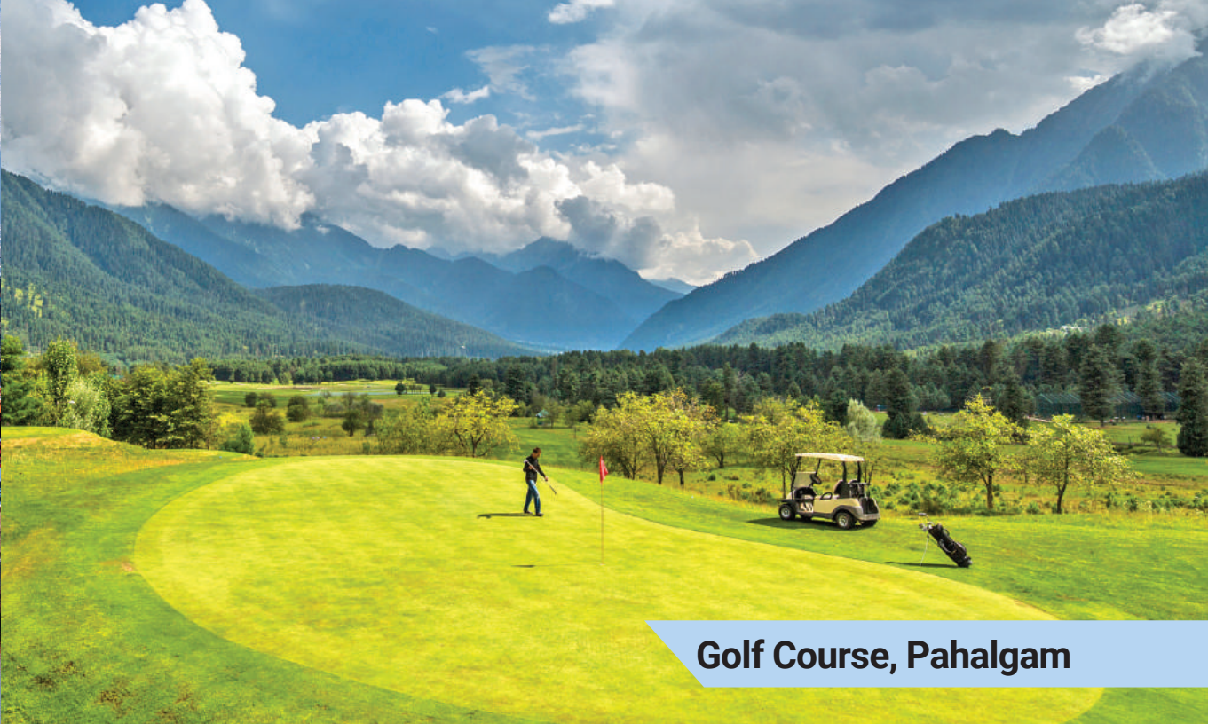
Golf Course, Pahalgam