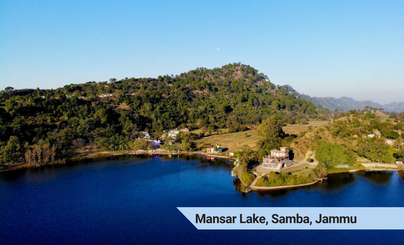
Mansar Lake, Samba, Jammu