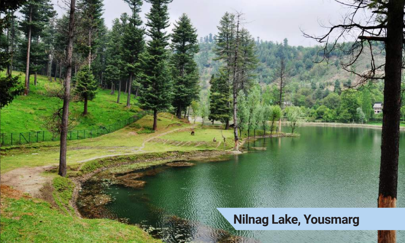
Nilnag Lake, Yousmarg