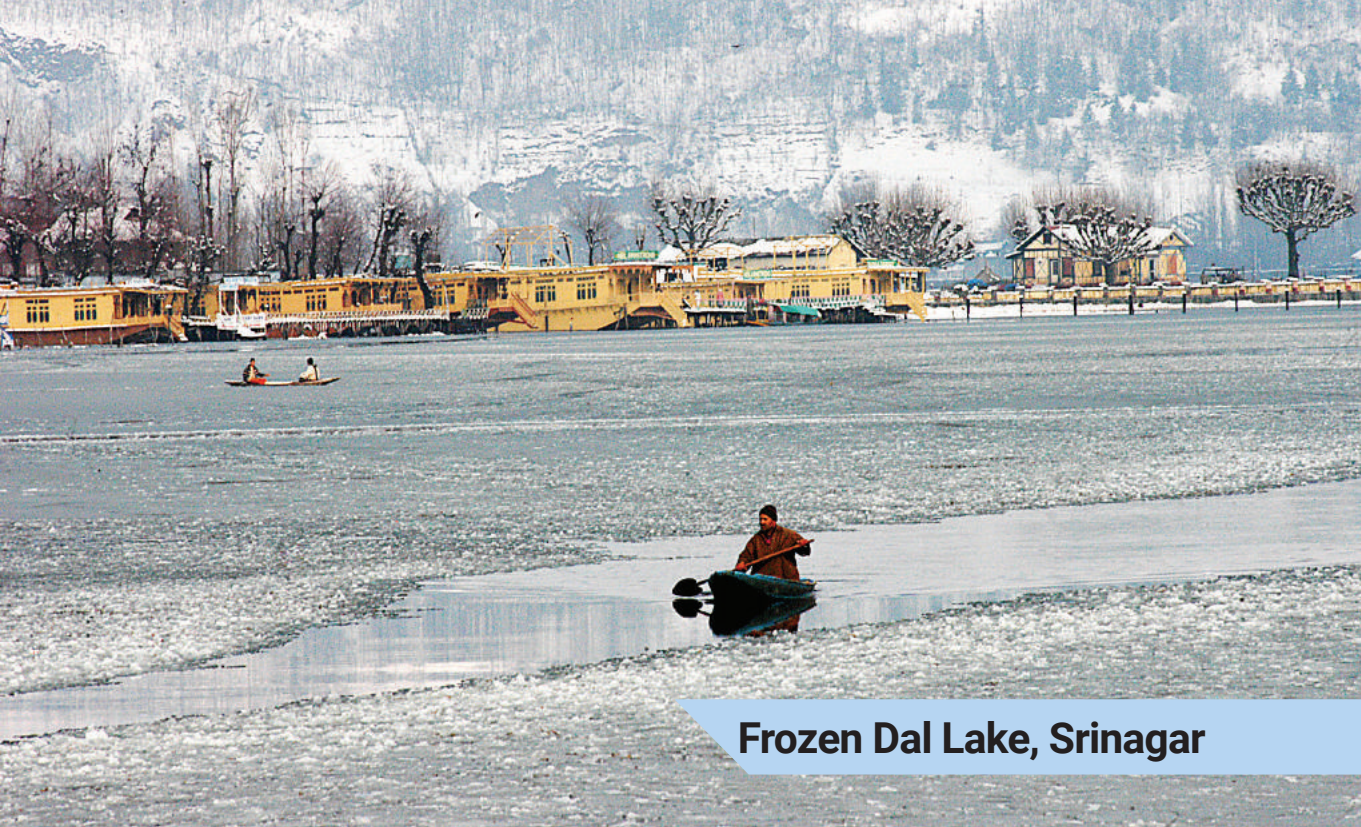
Frozen Dal Lake, Srinagar