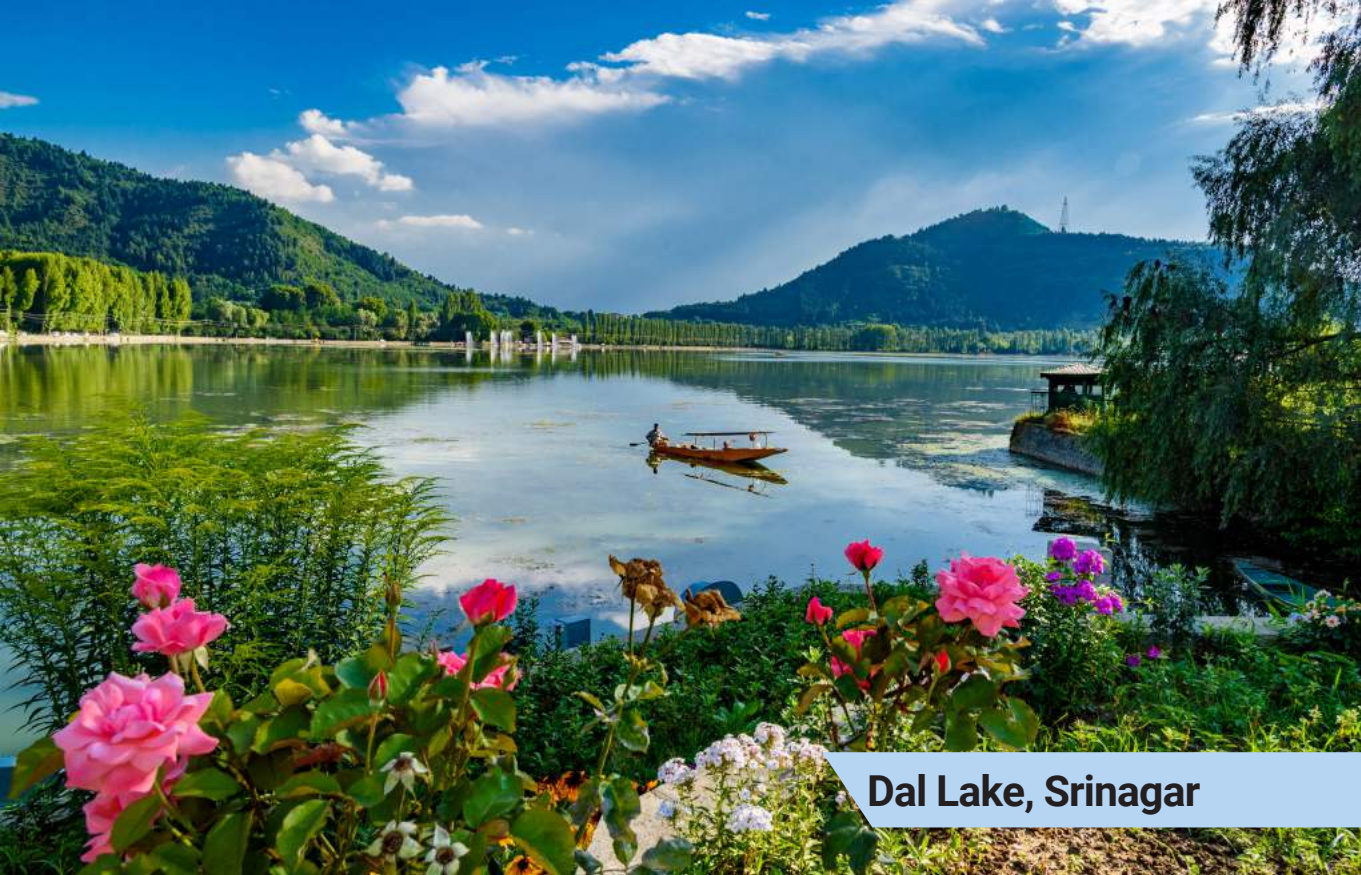
Dal Lake, Srinagar